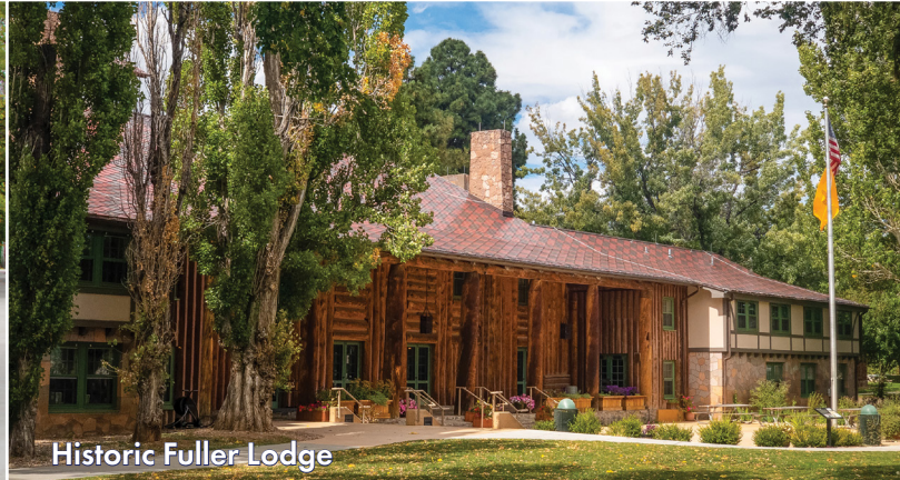
Historic Fuller Lodge