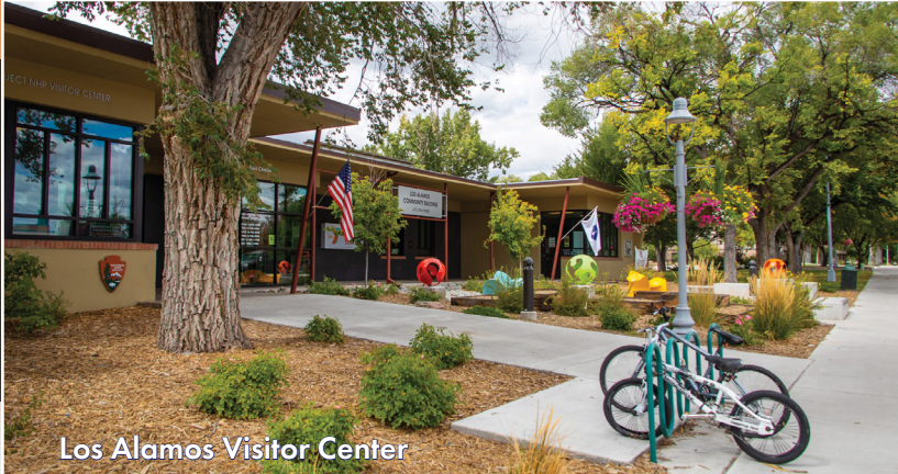
Los Alamos Visitor Center