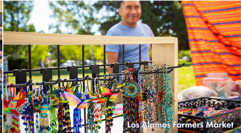
Los Alamos Farmers Market