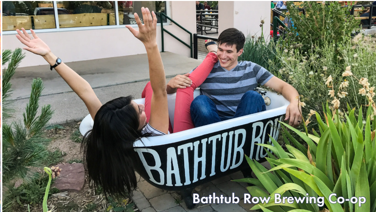
Bathtub Row Brewing Co-op