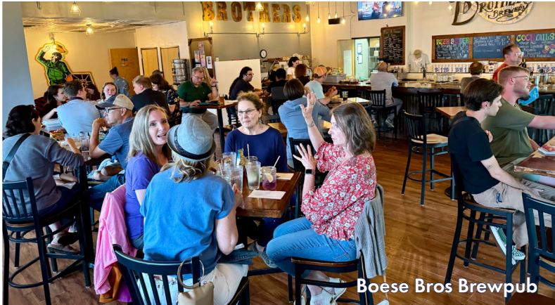
Boese Bros Brewpub